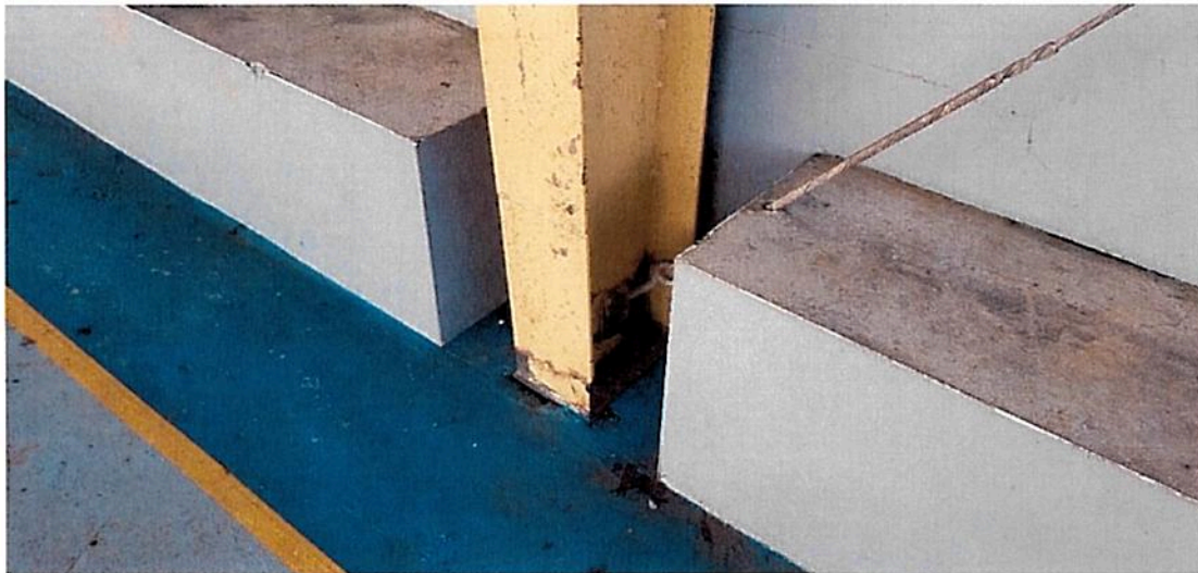
Photo #2 Corrosion in Steel Column base plates in Basketball Court