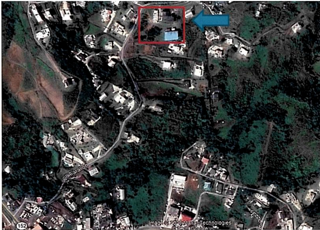
Location of Escuela Nueva Barranquitas School in Barranquitas Puerto Rico